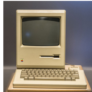
B. Apple Macintosh