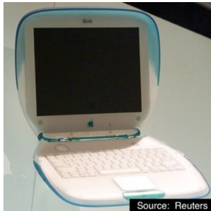
A. Apple iBook

Look at these pictures of Apple products and put them in order according to when they appeared on the market. Then, answer questions below.