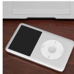
D. Apple iPod