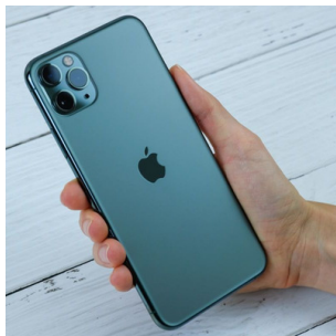
C. Apple iPhone